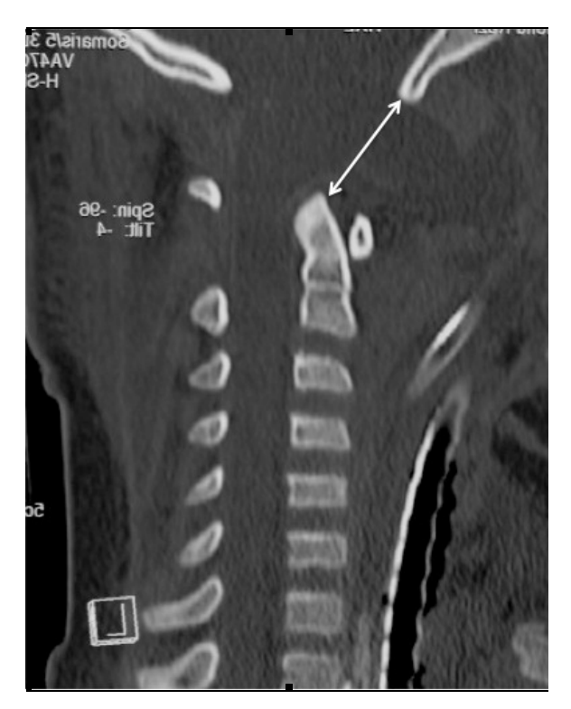
Figure 1: Mid-sagittal reformatted computed tomography scan of the cervical spine in the bone window setting demonstrates widening of the atlanto-occipital joint with a basion-dens interval (arrow) measuring 25 mm.