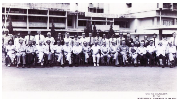
Figure 7: First International Symposium in Neurology and Neurosurgery held in Institut Kajisaraf in 1975; in conjunction with official opening of Institut Kajisaraf Tunku Abdul Rahman.