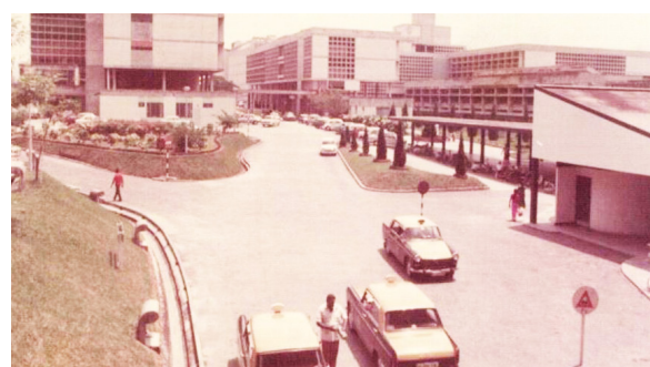
Figure 4: Hospital Kuala Lumpur in 1970's; Oncology Block on Left and Institut Kajisaraaf Tunku Abdul Rahman on Right.