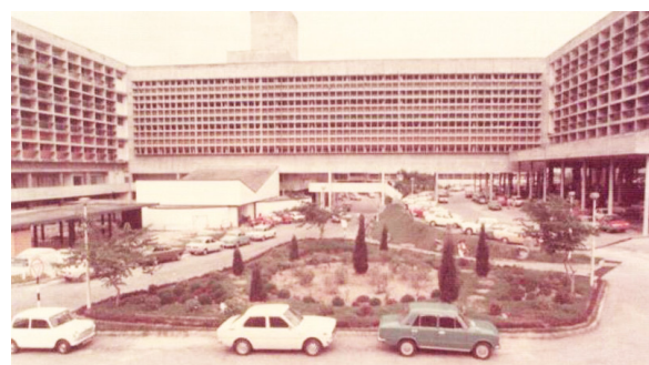
Figure 3: Hospital Kuala Lumpur in 1970's; General Wards and Administrative Building.