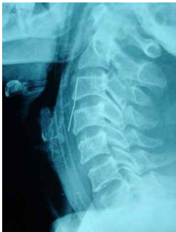
Figure 1: Foreign body visualised on a radiograph at the time of admission.

A 50-year-old female presented to the Otolaryngology Outpatient Department, St John's Medical College and Hospital (a tertiary care centre in Bangalore, South India) with complaints of a pricking sensation in her throat for 4 days. She had been examined at a district hospital, and serial radiographs were taken, which showed a foreign body in the right retropharyngeal area. The patient was referred to our centre for further management. An initial radiograph taken at the time of admission confirmed the presence of the foreign body in the right retropharyngeal area (Figure 1).