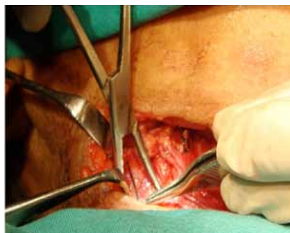
Figure 4: Foreign body found embedded in the carotid sheath.

(b) Foreign body with the two needles seen on an intraoperative radiograph.