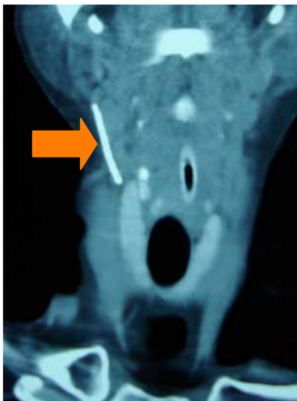
Figure 2: Computed tomography image showing the foreign body in the lateral pharyngeal wall.

A careful search was made for the foreign body under general anaesthesia with intraoperative radiographic aid. The FB could not be located; thus, an open lateral cervical approach was used. Two needles were placed below the skin in the neck, and intra-operative radiographs were taken to locate the foreign body (Figure 3). An oblique incision was made from the hyoid bone to the thyroid cartilage, and the lateral pharyngeal wall was exposed. Another attempt was made to visualise the foreign body using direct laryngoscope-assisted trans-illumination from the oral cavity. This again proved to be unsuccessful.