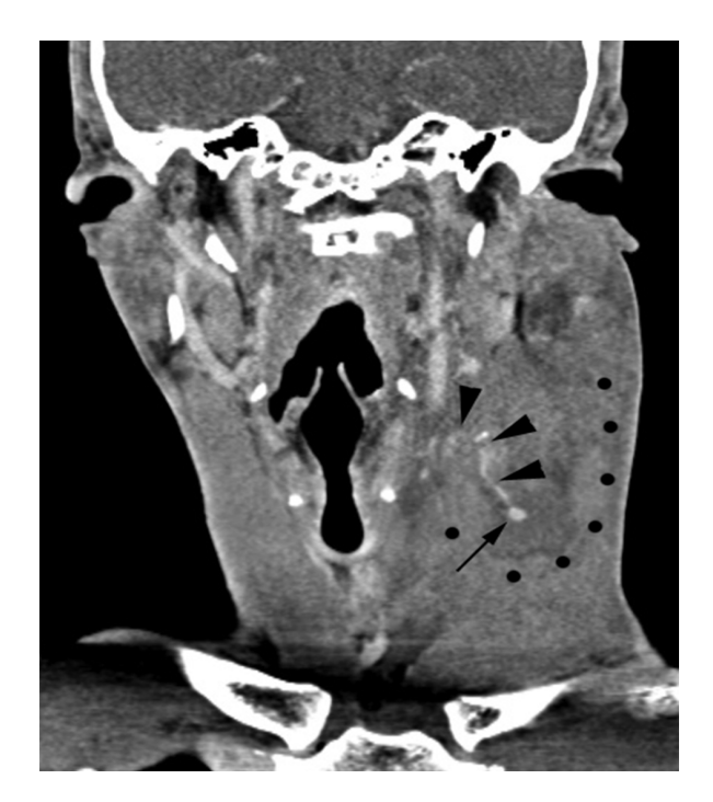
Figure 1: Coronal reformatted contrasted computed tomography of the neck showing an opacified artery (arrowheads) demonstrating a hairpin turn that leads to a focal ovoid region of active contrast extravasation (arrow) within the neck haematoma (its inferolateral margin is marked by dotted lines).

The patient underwent the procedures 5 hours post-trauma without any deterioration of the airway. Post-embolisation, he was observed for 2 days, during which the neck swelling decreased in size by more than 50%. He did not experience ipsilateral tongue numbness or sustain any neurological deficits as a complication of the procedure. At 6 months post-trauma, his neck was healed with total resolution of swelling and normal mobility.