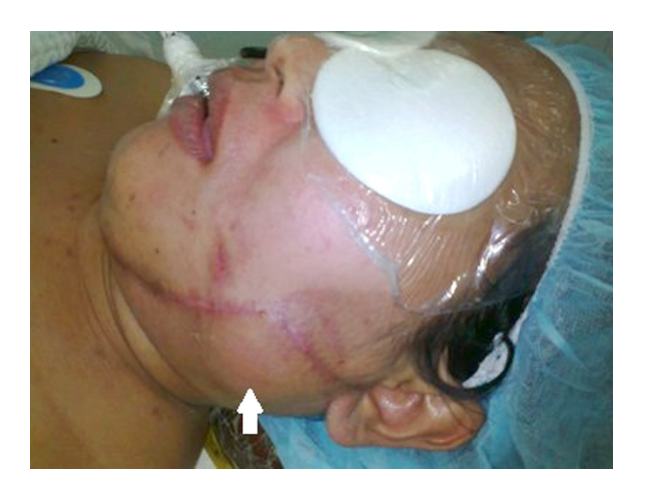
Figure 1: Photograph of the patient showing a laceration scar across the left cheek extending from the left ear to the mandible with a large swelling on the parotid region (white arrow).

A technique of peroral catheter drainage has been previously described, and almost all the authors reported excellent results in their patients (4–7). Demetriades reported the largest series to date, and showed a success rate of 92% in 12 cases (7). In his technique, a small skin incision is made at the facial scar over the sialocoele, through which a small forceps is used to enter the cyst and puncture into the oral cavity. Using the forceps, a catheter is then introduced into the cyst via the oral cavity and secured to the oral mucosa, and the skin incision is closed with a single suture. We used a sinuscopy trocar cannula to puncture the sialocoele from within the oral cavity, which we considered safe for a large palpable cyst like that in the present case. This spared us from an external approach via a skin incision, as sometimes a thick scar and fibrotic tissue may complicate the access into the cyst. Insertion of the drain can be done via the trocar cannula, which is simple and efficient. The drain is anchored in such a way as to allow for better fitting to the buccal mucosa, while at the